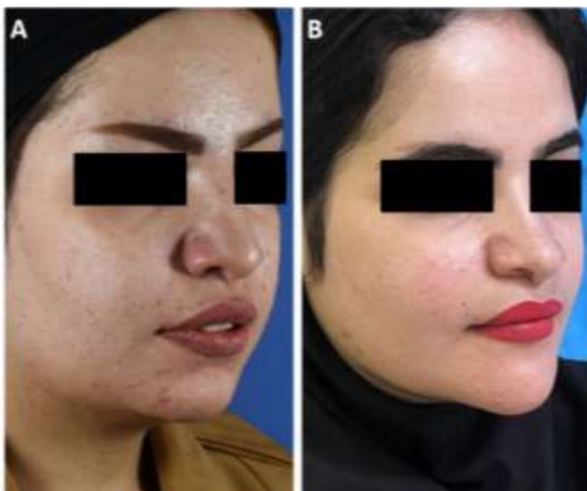
Figure 3. Images of the female patient undergoing surgery with the modified method. preoperative (A) and postoperative after 2 months (B) profile photoslide (Published with the patient's consent).

Figure 3 (A and B) shows the photo slides of a female patient with class I malocclusion because of vertical maxillary excess which can show long gamine and lip incompetency. She was operated using the new modified reduction method introduced in this article. As a quick conclusion after the surgery, no additional angle is observed along the jaw line. On the other hand, the general condition of the patient was good during post-water stages and no swelling, infection or additional chronic pain was reported.