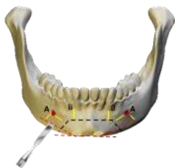
Figure 1. Schematic of bone separation method according to mental foramen (A) and alveolar process (B).

Figure 1 shows the releasing method described in the method section. To separate the bone from the two areas of the mental foramen (A) and the alular process (B), there should be a distance of 5 mm, and the cut with an approximate angle of 120^\circ in this area is done safely and without damaging the jaw nerves.