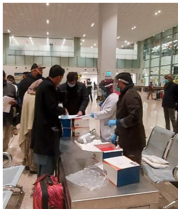
Figure 1. RAT Testing for COVID-19 at Islamabad International Airport, Islamabad

The standing operating procedures for primary and secondary screening were formulated according to National Action Plan guidelines and included in the emergency and preparedness plan of POEs (Table 2).