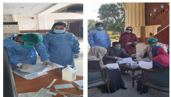
Figure 3. Health Screening for COVID-19 at Wahga Border, Lahore