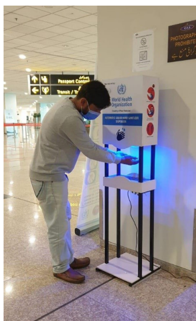
Figure 4. Automatic Hand Sanitizer Machine at Islamabad International Airport, Islamabad

by CHE an attached department of the Ministry of NHRS & C (National Health Services Regulations and Coordination) . It was the main stakeholder in the implementation of the National Action Plan for COVID-19 at POE. The CDC guidelines are intended t to provide a qualitative assessment of the current capabilities and capacities at the POE of Pakistan. Public health leadership at National Command and Operation Center used these qualitative results in conjunction with other, relevant data sources, including the epidemiologic context of the pandemic globally, regionally, nationally, and