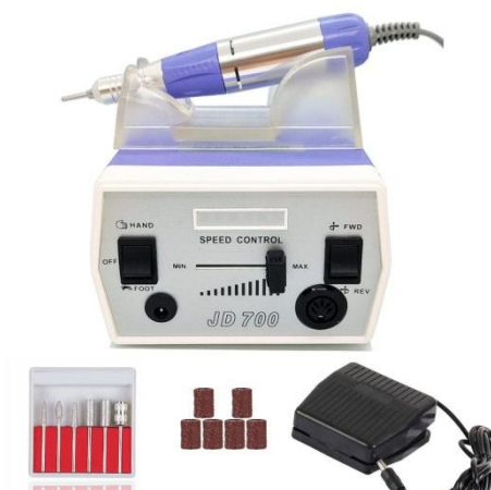
Figure 4: nail file machine