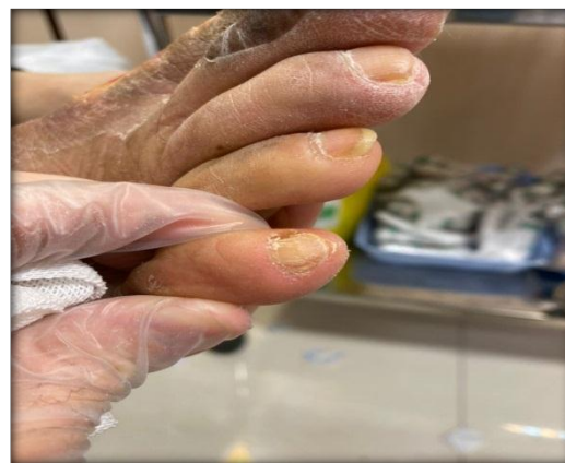
Figure 6: Treated nail, fifth toe of right foot