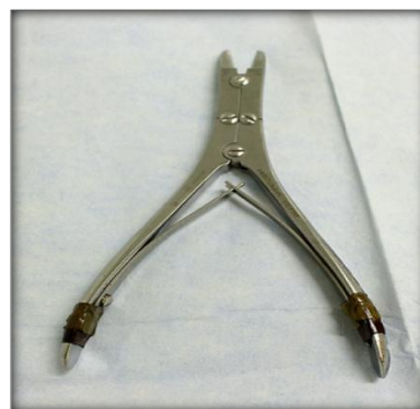
Figure 3: Dual-action nail clippers

older individuals. The nail's growth is reversed, causing the nail plate to grow upward first and then pierce one of its two lateral fingers 17, 18 . In rare cases similar to that seen in our patient, the nail moves down and continues to grow instead of turning to the sides. During this deviation, the nail rotates like a ram's horn, hence the name. If the patient's nails are not removed completely, the complication may still occur due to poor personal care of the elderly, severe neuropathy common among them because of diabetes, and inability to perform routine foot hygiene, causing piercings on the toes. On the other hand, if the entire nail tissue is removed using the Matrixectomy procedure, re-growth of the nail on the toes is unlikely due to the loss of the germinal tissue of the nail, which may not be aesthetically pleasing for some patients 1,19 . However, some studies have concluded that complete removal of nail tissue is part of the definitive and necessary treatment process for Onychogryphosis 20, 21 . In our patient's case, we focused on maintaining the integrity of the nail according to his personal preferences. After explaining all the conditions, including the possibility of pathological nail regrowth, we proceeded with the described treatment process.