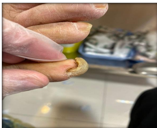
Figure 2: Onychogryphosis in fifth toe of right foot