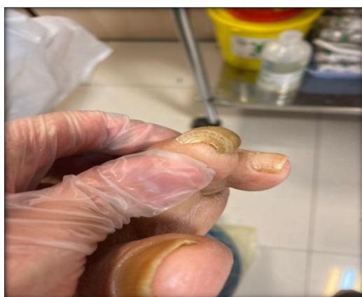
Figure 1: Onychogryphosis in second toe of left foot