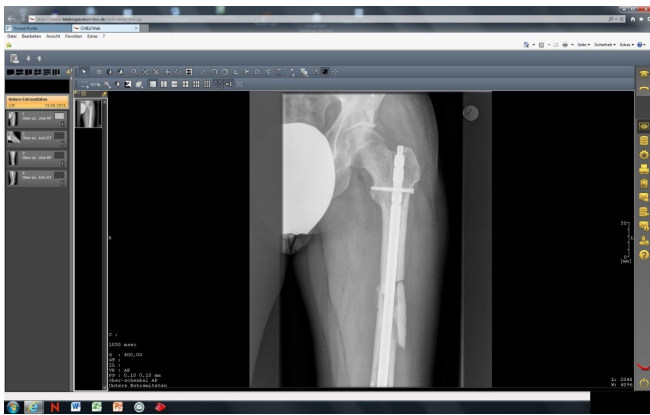
Figure 2. Teleradiological transmission via TKmed®.

pertaining to the appropriateness and consequences of medical advice. Generally, doctors will recommend seeking a colleague's opinion if a patient has concerns. This either leads to further options or the elimination of concerns if both medical statements are identical. Some specialists offer specific teleconsultation hours, so that patients do not have to come in person, which is advantageous for sparsely populated and less developed regions (Figure 2).