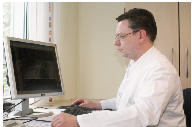
Figure 3. Second Opinion

Patients, established specialists, and rehabilitation facilities should be able to upload their own radiological images to the communication platform and send it to the respective recipient using any web-enabled computer. This would empower patient communication, enabling a treatment plan based on an equal partnership. Furthermore, direct and comprehensive communication enhances optimal patient safety as well as prompt treatment. With this system, the patient can save time and effort by transmitting images and documents directly online to the respective physician, avoiding waiting times, unnecessary travel, and redundant tests (radiation exposure). It also facilitates the hospital workflow, which is another benefit for patients. Simultaneously, healthcare costs are reduced, but quality of care is improved.