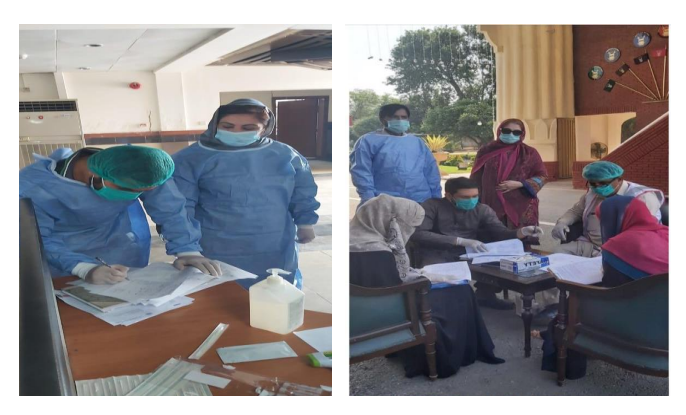
Figure 3. Health Screening for COVID-19 at Wahga Border, Lahore

According to the results of this study, the evidence showed that the eleven attributes of health screening as per CDC guidelines had been well recognized and implemented at POEs