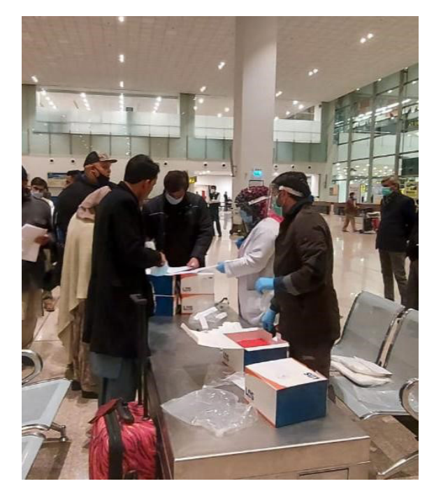
Figure 1. RAT Testing for COVID-19 at Islamabad International Airport, Islamabad

The standing operating procedures for primary and secondary screening were formulated according to National Action Plan guidelines and included in the emergency and preparedness plan of POEs (Table 2).