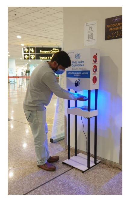
Figure 4. Automatic Hand Sanitizer Machine at Islamabad International Airport, Islamabad

by CHE an attached department of the Ministry of NHRS & C (National Health Services Regulations and Coordination) . It was the main stakeholder in the implementation of the National Action Plan for COVID-19 at POE. The CDC guidelines are intended t to provide a qualitative assessment of the current capabilities and capacities at the POE of Pakistan. Public health leadership at National Command and Operation Center used these qualitative results in conjunction with other, relevant data sources, including the epidemiologic context of the pandemic globally, regionally, nationally, and